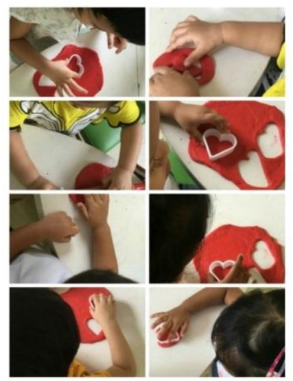
Day Care Center GIZ Bangladesh

However, initially the challenge was that there was lack of inhouse capacity to operate a day care centre at GIZ premises. As such, GIZ BD representatives visited existing day care facilities in the secure diplomatic zone around GIZ BD offices, and decision was taken by the management to outsource the day care services to one of these existing day care centres in the office locality through a competitive tender bidding process, coupled with a rigorous technical assessment. Beyond the labour law requirement which requires day care services to be provided specifically for female employees, GIZ BD also makes its day care services available to its male employees to be at gender par.