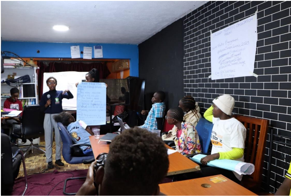
Children engaging and discussing child-friendly solutions for the NCCAP III