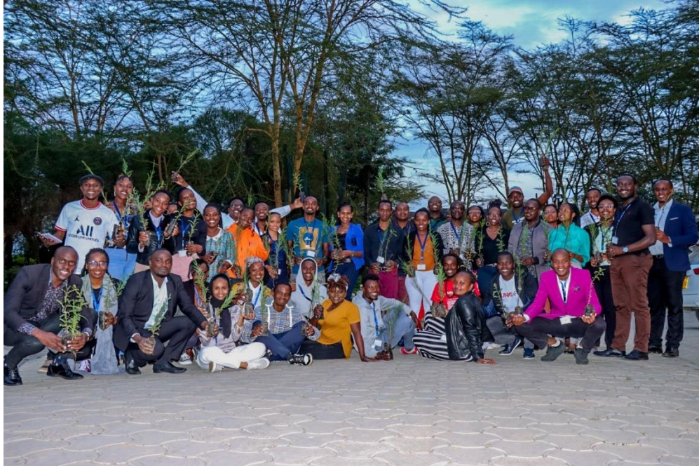
Tree planting at the Nairobi Youth NCCAP III engagement workshop

GIZ Kenya NDC Assist II project in conjunction with @UNICEFKenya , the GIZ Sector Programme Human Rights and Ministry of @Environment Ke #ClimateChangeDirectorate enhanced youth engagement in the review of the National Climate Change Action Plan(NCCAP III) 2023-2027. This could not have happened without support from @MTotoNews @UNICEFKenya @Environment_Ke @BMZ_Bund