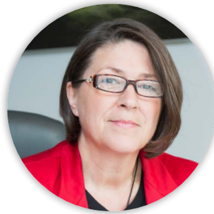
Violeta Bulc SI