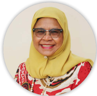
Maimunah Mohd Sharif MY

Executive Director, UN-Habitat Cycling Advocate